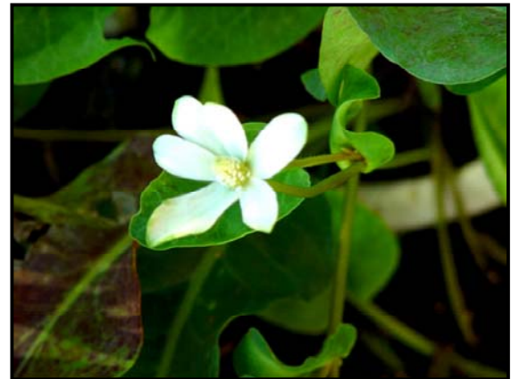
Yerba Mansa ( Anemopsis californica )

I'm a perennial herb, also known by other names such as Bearsweed, Mountain Balm, and Swamp Root. As part of the Saururaceae (Lizard's Tail Family), I thrive in bog areas, and also do quite well, potted, as a shallow marginal in ponds. I thrive in saline and alkaline soils that many plants find inhospitable. Visitors to your pond will probably make a statement something like, "I've never seen one of THOSE before!"