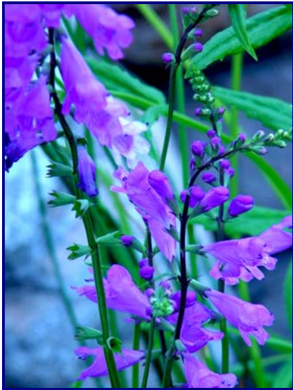
Obedient Plant ( Physostegia virginiana )

Featuring Plants That Love Our Desert Water Gardens